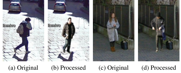
Figure 3: Some lighting errors due to the different light conditions of the original scene and the scene belonging to the replacing pedestrian.

After having identified the most similar pedestrian to the one to be replaced, it is separated from the background using the segmentation mask and, after a resiz-